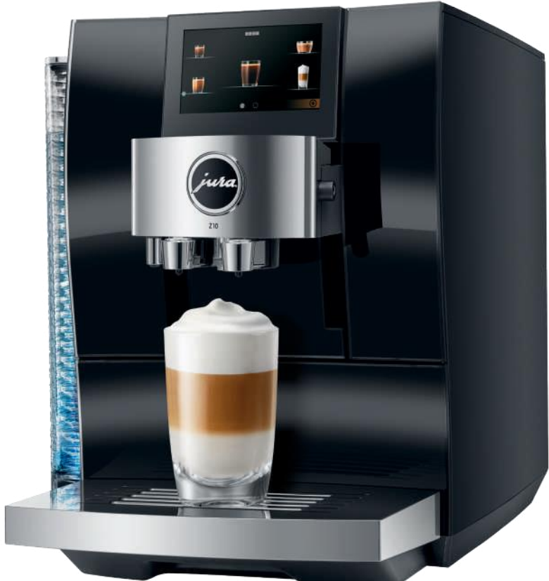
15423 JURA Z10 black

Z10 with P.R.G. for hot and cold brew speciality coffees