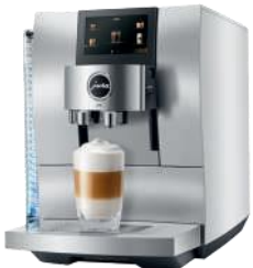
15360 JURA Z10 alu