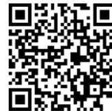
JURA Z10 alu