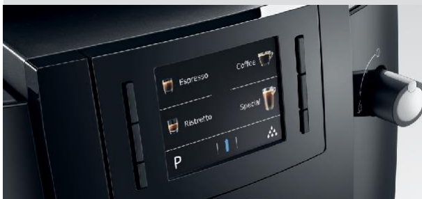
TFT color Display for easy Operation