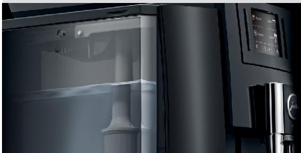
Intelligent Fresh Water System with RF Technology