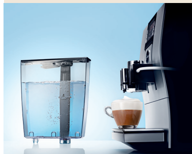
Intelligent Fresh Water System with RFT