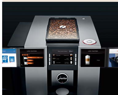
Extremely simple operation