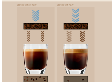
P.E.P.® Brewing System